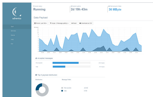
The SecuriCDS DD1000i dashboard provides real-time and historical information of the information flow.

Advenica supports third party development by having an SDK available for proxy service development. Even if Advenica is a trusted supplier, you may select internal resources or other consultants for proxy development. Advenica's SDK allows for you to focus on the custom functionality, while still benefit from the security platform that SecuriCDS DD1000i provides.